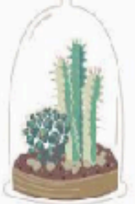
Bloom WHERE YOU ARE PLANTED

My 3 sisters and I grew up right here in Tempe and my parents still live in our childhood home. I attended Kyrene schools, Cielo and Pueblo, then graduated from Corona del Sol. My favorite childhood memories include softball, friends and family, travelling to Chicago, and fishing at the lake.